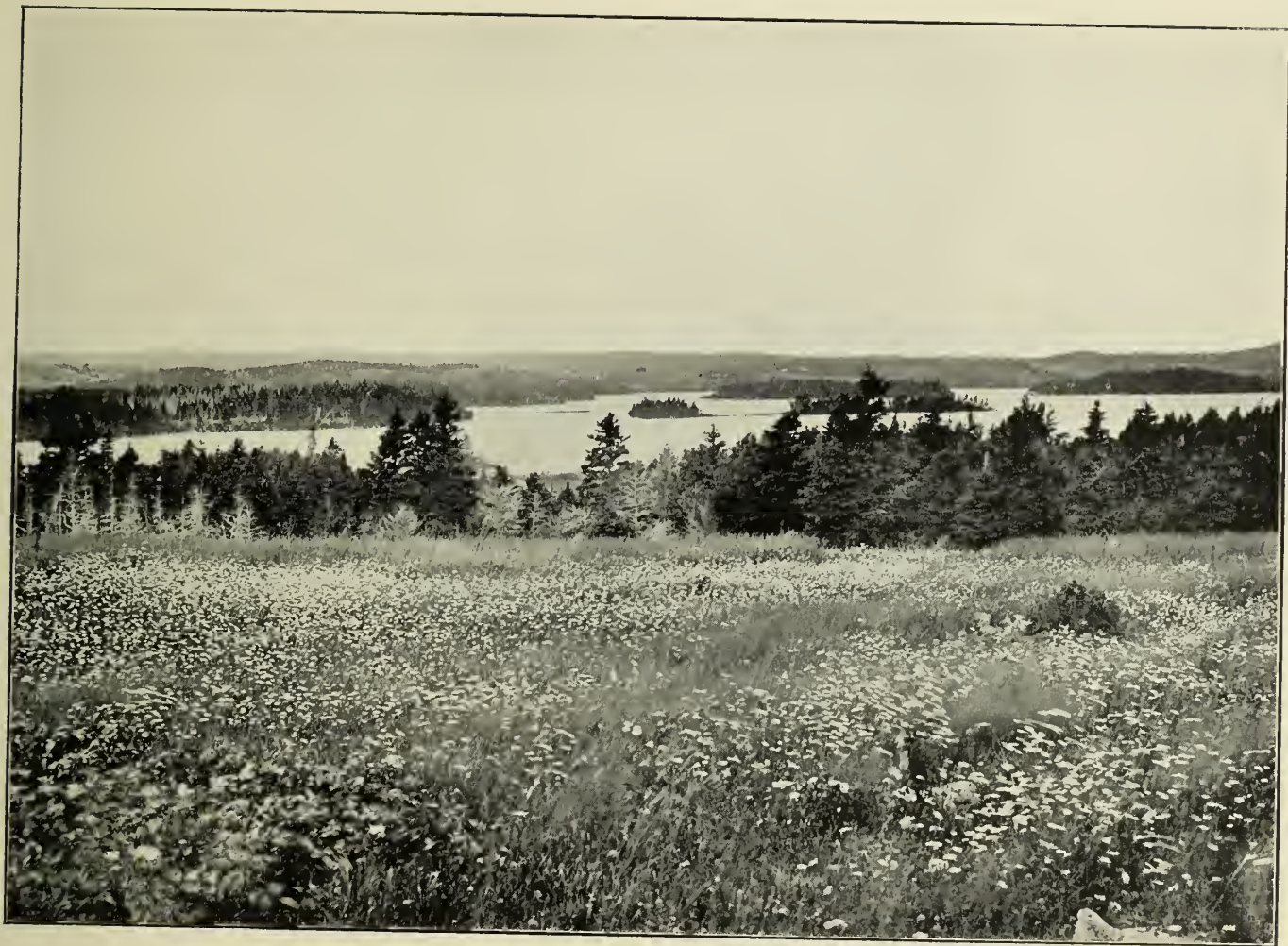
CATALONE LAKE ON THE ROAD TO LOUISBURG, C.B.